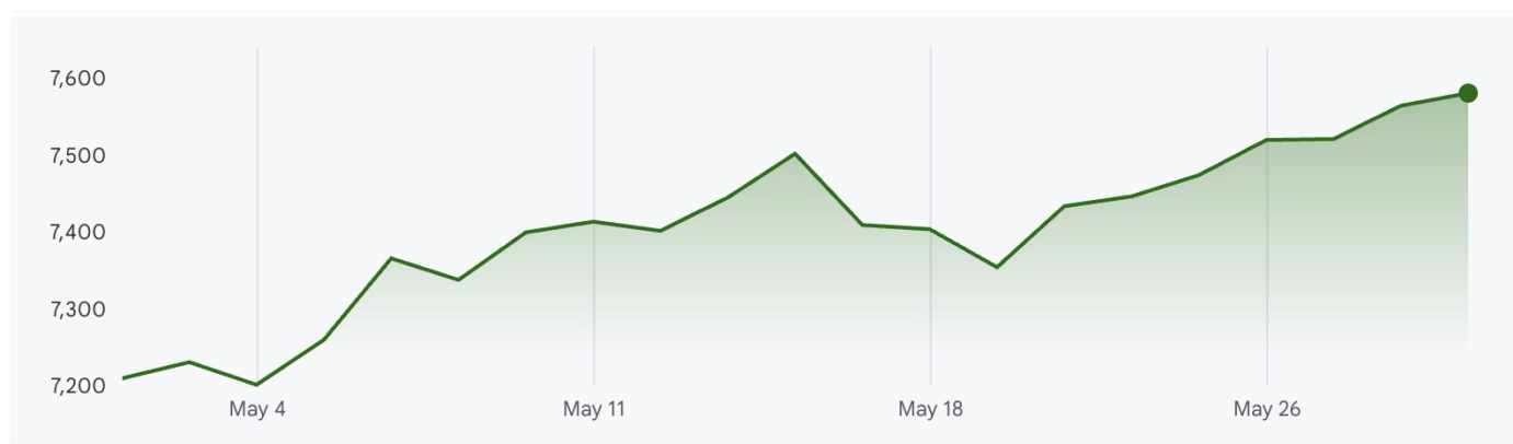
S&P 500 Performance in May 2026 - Google Finance

Turning our attention to the United States, the month of May 2026 was a stellar period for the US equity market, as evidenced by the S&P 500 chart provided in the graph below. Opening the month near 7,200 points, the index experienced a brief dip around May 4. This initial hesitation reflected investor apprehension following the Federal Open Market Committee meeting on April 29.